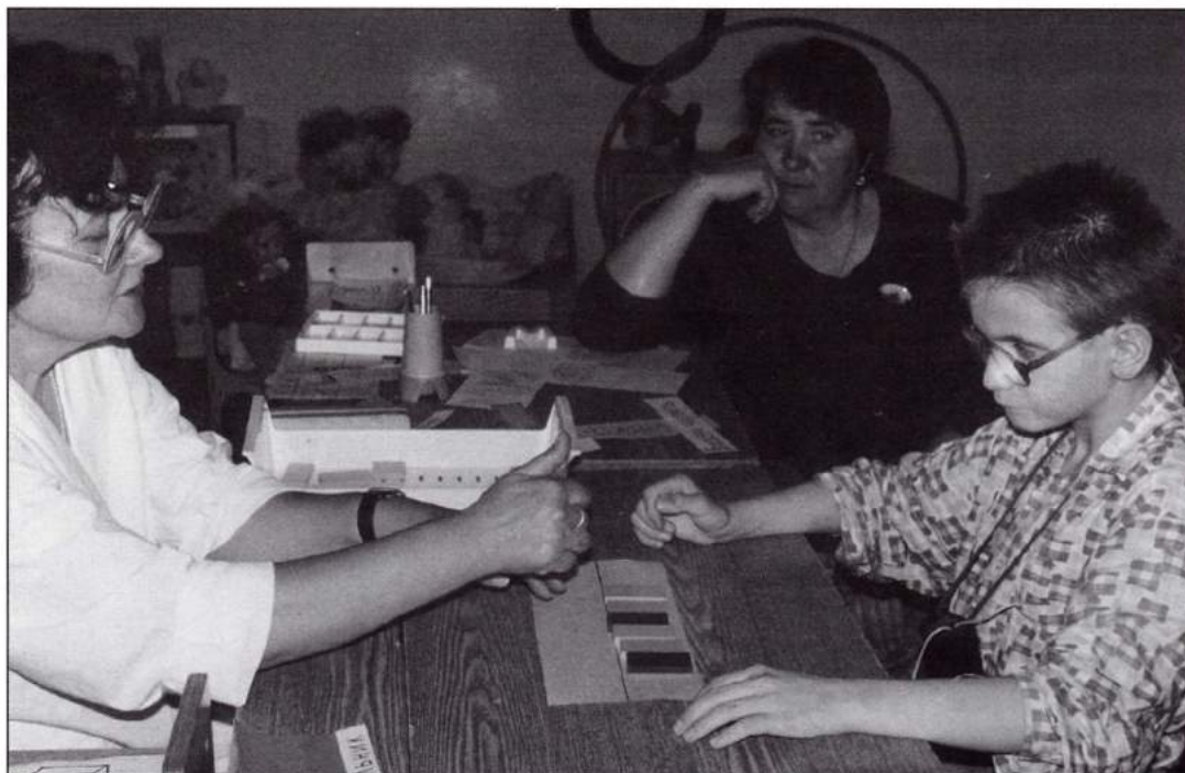
(Left, below and opposite page) Staff and students at the Sergiev Posad School

and clinics for deaf children. They have a particular interest in Usher syndrome.