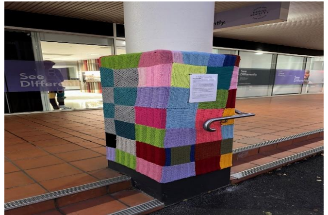
Yarn bombed structure in Australia

In June 2023, over 30 installations were created in DbI's third yarn bombing initiative, with colourful, tactile displays on fences, pillars, bicycles and community spaces around the world!